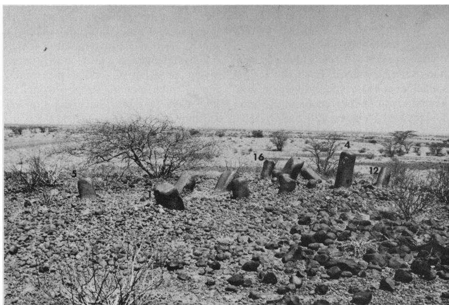
Fig. 2. Pattern of stones at Namoratunga II.

21 November 1977; revised 8 February 1978